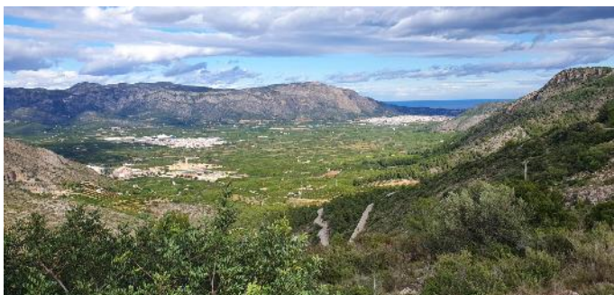
View of the citrus area in south Valencia, Spain